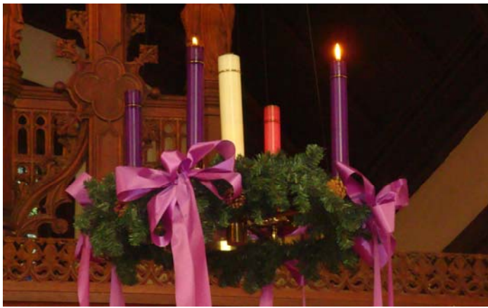
Our 2009 Advent Wreath